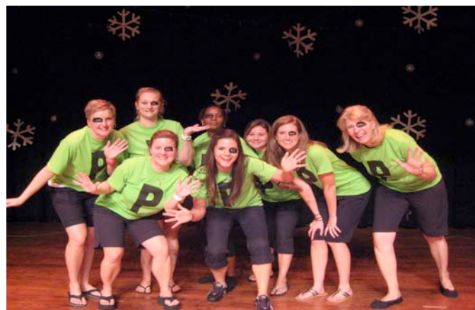
Pictured is the "Black-eyed P's" teacher act.

Lakeshore Elementary students recently showcased their talents in the 2 nd Annual Lakeshore Talent Show, Rockin' In A Winter Wonderland. Student acts ranged from archery and karate to dancing and singing. The show was culminated with the long awaited dancing teacher act. This year's show was a huge success and a great time was had by all!